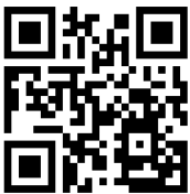
Explanatory video about the »Weimar model«

At the Bauhaus-Universität Weimar's Faculty of Art and Design, you will study in projects based on the »Weimar model«. Every semester, you will take an intensive look at a particular topic or question. A standard study day includes regular discussion and collaboration with fellow students and intense discussions with instructors. There are also individual consultations where professors focus on each individual student's personal projects. You will spend the majority of your time in a workspace or workshop, experimenting in studios and labs, or conferring with your fellow students.